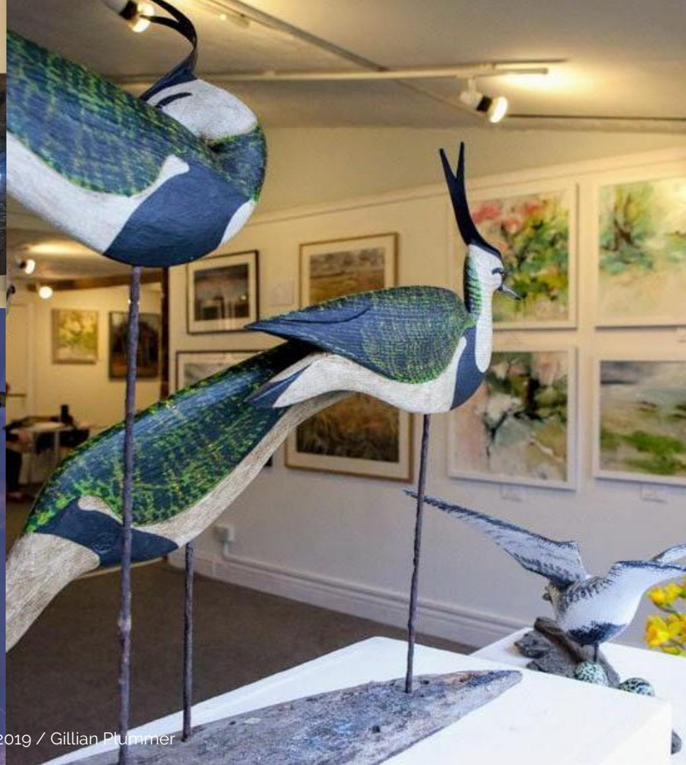
Clockwise from left: The Secret Art Fair 2019 / Matt Mackman / The Secret Art Fair 2019 / Gillian Plummer